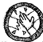
10. MARTIAL ARTS