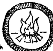
12. SURVIVAL SKILLS