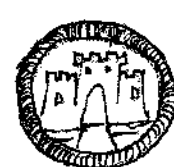
9. LOCAL KNOWLEDGE