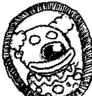
3. CIRCUS SKILLS