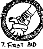
7. FIRST AID

though you had it. If you both have the same badge, roll 3D6 and pick the highest when you make a relevant action. You can, if they're present in the scene, declare that your Companion is put in danger - describe what happens - and clear 2 stress from your character. The third time you do this, your Companion dies.