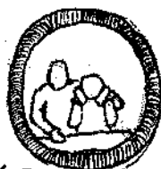
6. EMOTIONAL SUPPORT